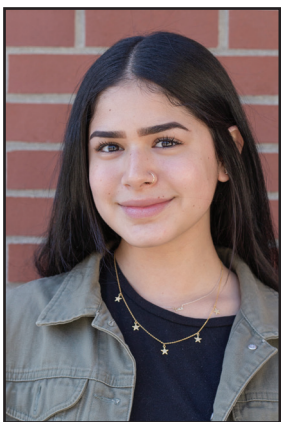
ELISA ESPINOZA Staff Writer