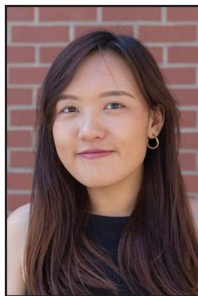
EVA MO Staff Writer