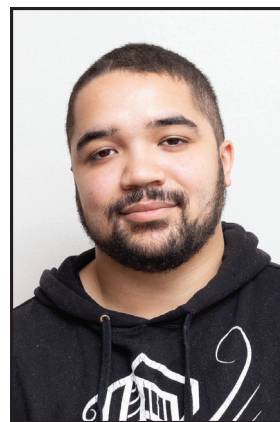
ALEX PIEROTT Staff Writer