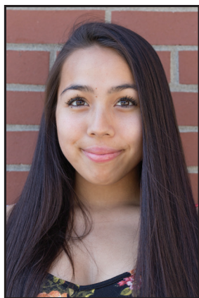
KATAUNA LOEUY Staff Writer